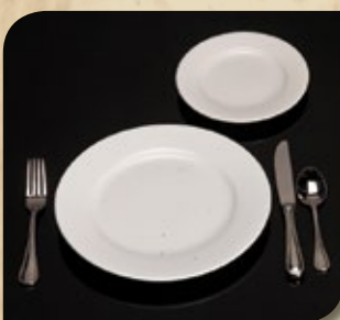
China Place Setting