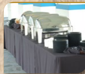
Simple Food Display