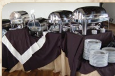
Elegant Food Display