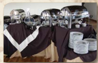
Elegant Food Display