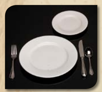
China Place Setting